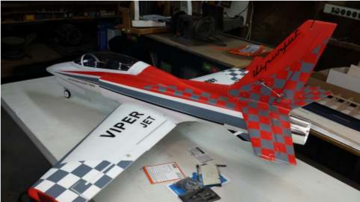
Some eye candy from a unnamed source