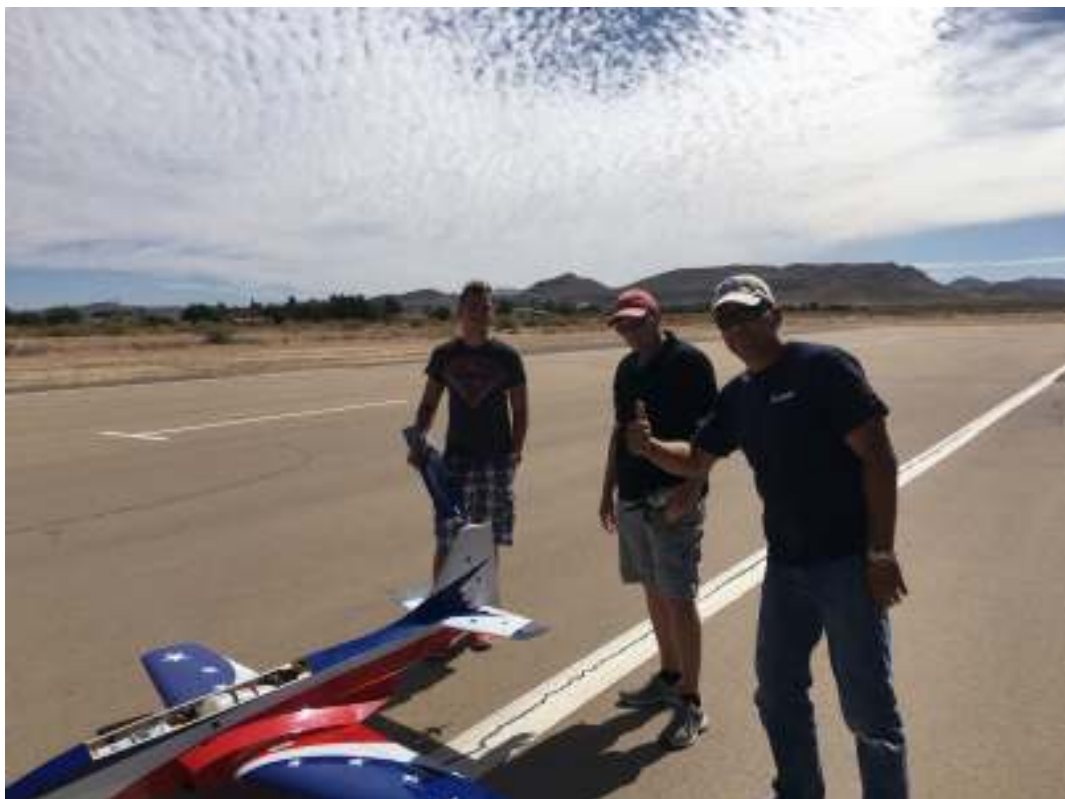
After the successful test flight