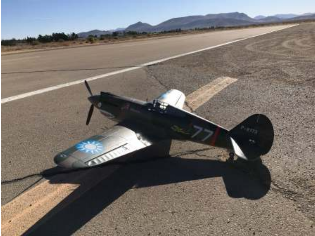
Hank G's P-40 great flyer